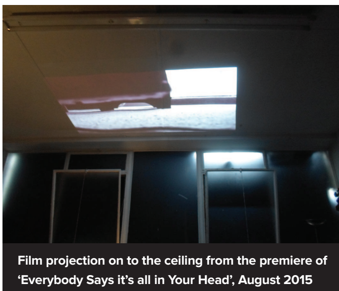
Film projection on to the ceiling from the premiere of 'Everybody Says it's all in Your Head', August 2015

In parallel to the above, through a 'filmpro lates' event the showcased artists are also prompted to consider accessibility of their work in practical terms, such as the difference subtitles can make to a range of audiences: deaf/hearing impaired people and anyone for whom English is a second language. More importantly, they are encouraged to make access provisions an integral part of their next art project and seek the right partnerships or funding for it.